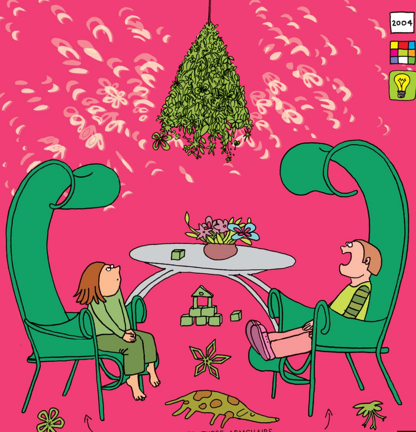
BOONTJE HAS DESIGNED THESE ARMCHAIRS AND THIS TABLE, TOO